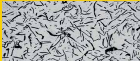
Even graphite distribution