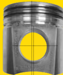
John Deere offset bore Center bore

The bore offset of a John Deere piston reduces vibration noise, mechanical stress, and surface wear. Reduced surface wear increases service life and decreases oil consumption and power loss.