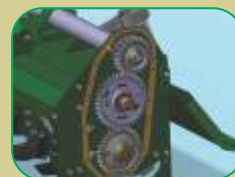
Side Drive Transmission- Gear Type with Oil Lubrication Highly durable. Less maintenance cost.