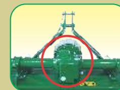
Heavy Duty Gear Box Better performance and enhanced reliability