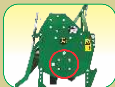
Oil Immersed Rotor Housing High durability due to less wear and tear