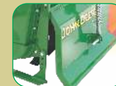
Nano Technology Paint • Corrosion resistant • Enhanced durability

For more information, please contact our authorised dealer or nearest area office.