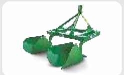
2 Bottom Ridger