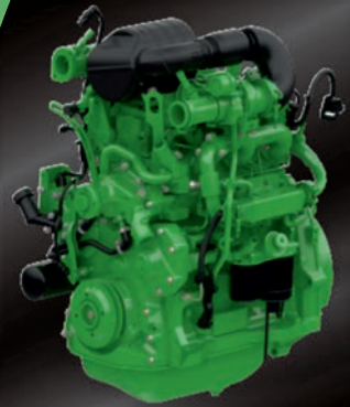
PowerTech™ HPCR ENGINE