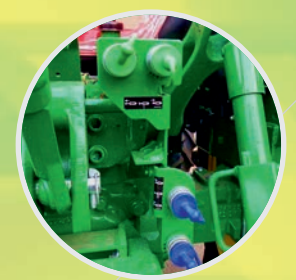
Factory Fitted 2 nd SCV (Dual SCV)