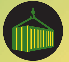
LiftPro™ HIGH LIFT CAPACITY