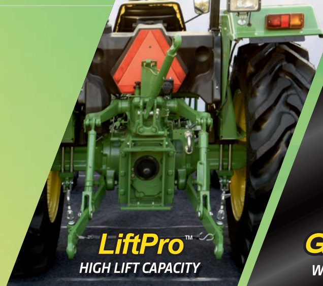
LiftPro™ HIGH LIFT CAPACITY

Usher in a new reign of prosperity with the King - PowerTech™ 5310 GearPro™ Tractor.