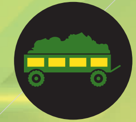
HIGH BACK-UP TORQUE