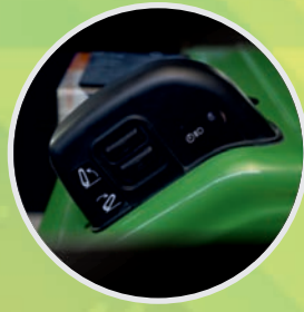
EQRL with Go Home Feature