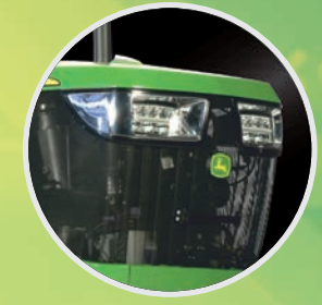
LED Headlamp with Wrap Around Chrome Bezel