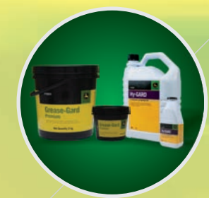
Longer Service Interval (500 hrs.)